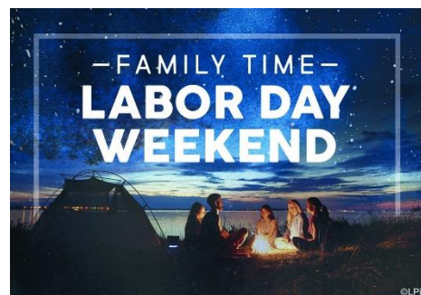
Labor Day Blessing